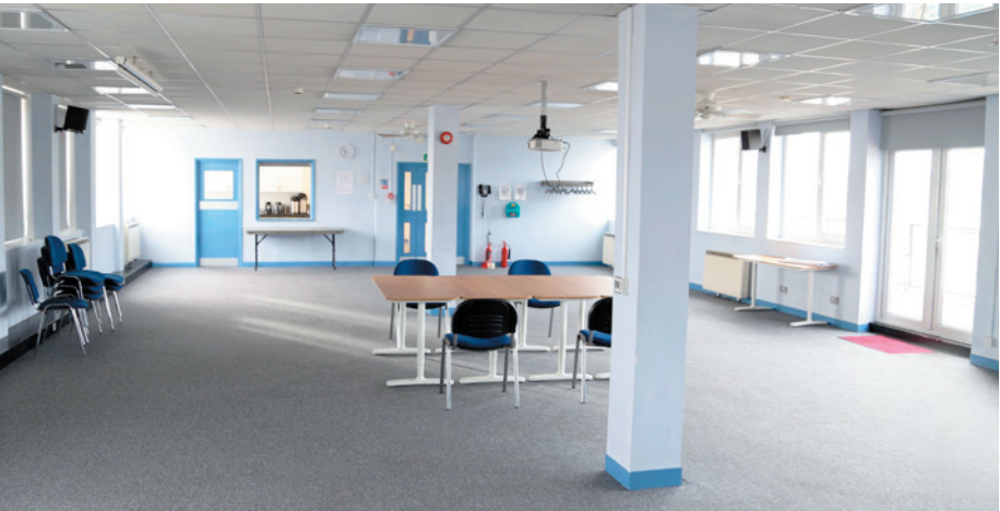
Our conference room (above) can accommodate 100 people. Our two small meeting rooms (below) can accommodate 12 people.

Community Base has a wide range of office spaces to rent, from single rooms to larger office suites and three affordable meeting rooms for hire in the heart of Brighton.